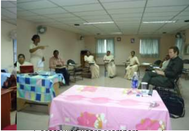
Meet with Board Members