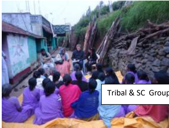
Tribal & SC Group - Kodaikanal

[Type a quote from the document or the summary of an interesting point. You can position the text box anywhere in the document. Use the Text Box Tools tab to change the formatting of the pull quote text box.]