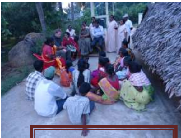
Pandravedu - Irulars

[Type a quote from the document or the summary of an interesting point. You can position the text box anywhere in the document. Use the Text Box Tools tab to change the formatting of the pull quote text box.]