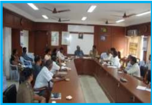
Child Line Directors Meeting