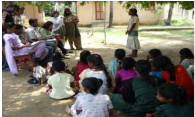
St. Katharina's Children's home was visited by MSW (Master of Social Work) students, St. Joseph arts and Science, Chennai.