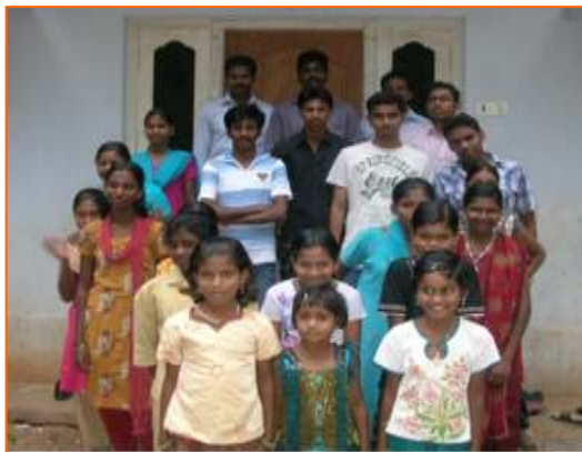
Students from DMI Engineering College visited children at R.M.Thurai and conducted games. The winners were awarded. Thanks to the members who took an initiative to meet these children.

MSW Students from St. Joseph College to Keechlam Students from Aralvoimozhi to R.M.Thurai home