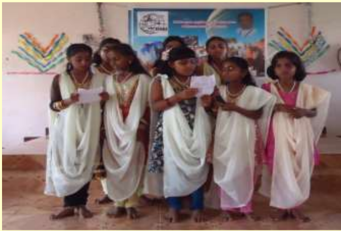
Together we Sing