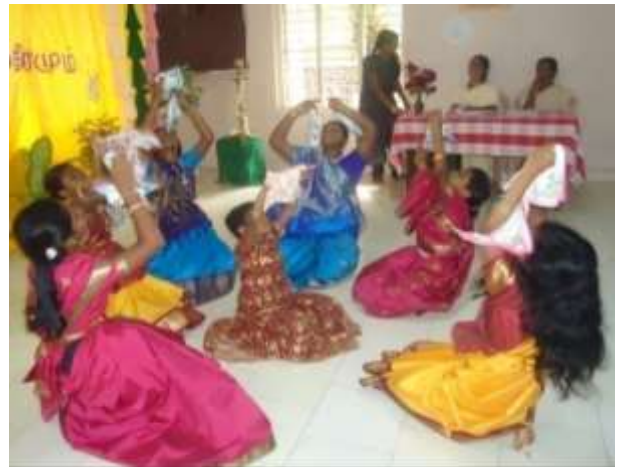
We are tested to become