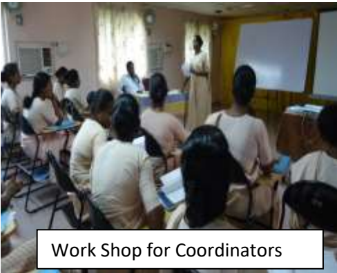
Work Shop for Coordinators