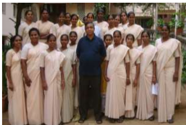
Quarterly Review Meeting was organized at Amala Bhavan, Chennai, for the sisters who are in-charge of the Children's Homes on July 15, 2011.