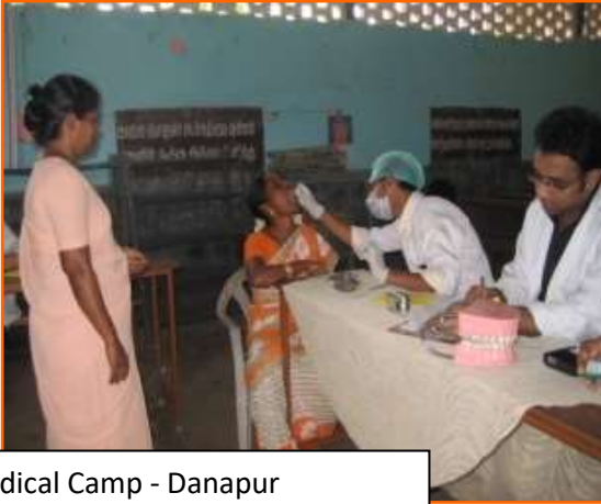
Medical Camp - Danapur