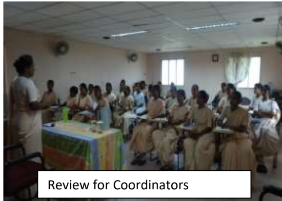
Review for Coordinators

Monitoring Visits to all the district by Development Team Members