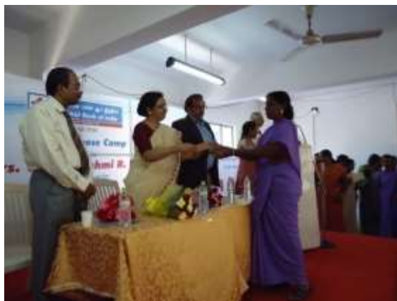
Receiving Revolving fund from Dep Chif Minister - Sivagangai

We have earned Rs 17,90166 as Business Partners from CBI during the current year.