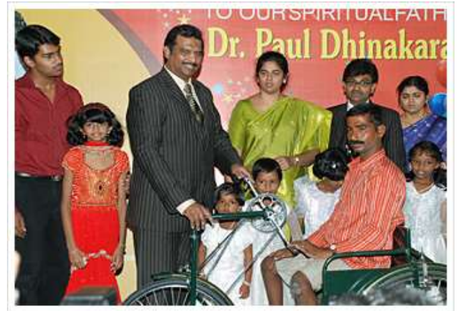
Tricycle – by Dr.Paul Dhinakaran - Kancheepuram

438 physically challenged person helped to get Rs.1000 as monthly assistance